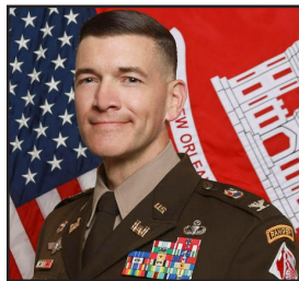
COL CULLEN A. JONES Commander, New Orleans District